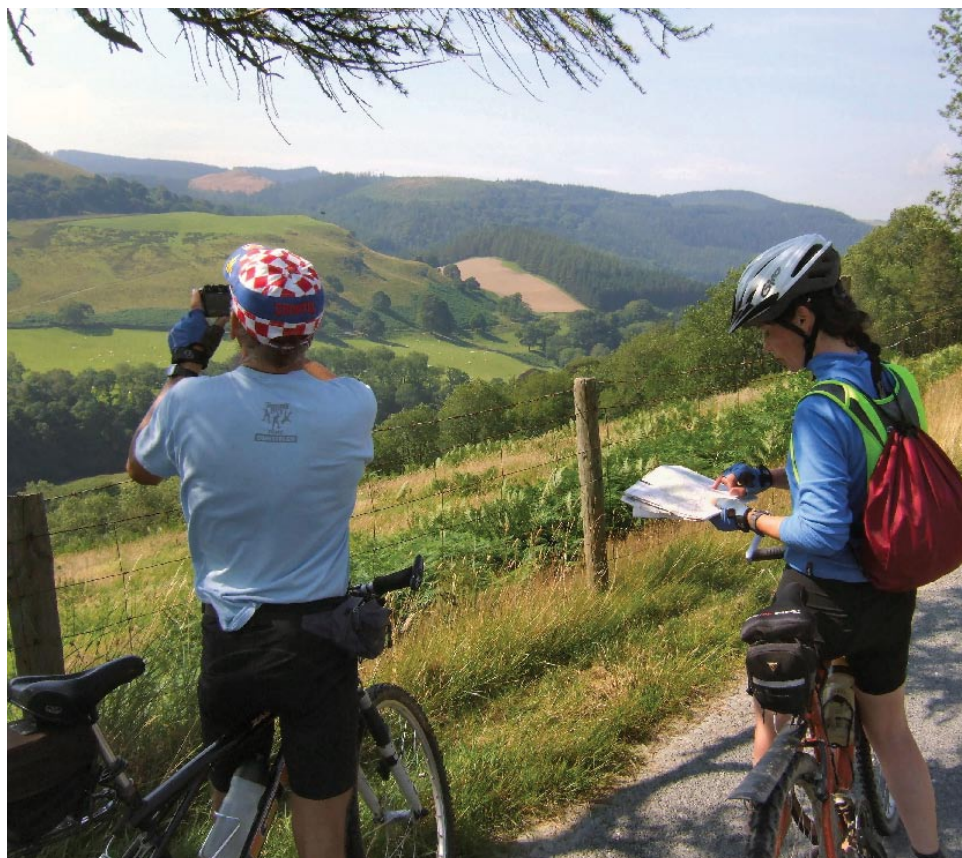
(Left) Near Cwmystwyth. Try the Miner's Arms at Pont-rhyd-y-groes for food (Below and bottom) You skirt Claerwen Reservoir on a rough moorland track