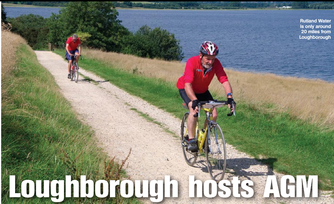
Rutland Water is only around 20 miles from Loughborough

RECENT & FORTHCOMING EVENTS IN THE CYCLING WORLD