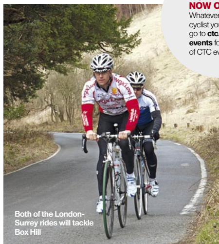
Both of the London-Surrey rides will tackle Box Hill

supporting the participants and will also get a chance to see pro cycling at first hand. Event details are at: prudentialridelondon.co.uk .