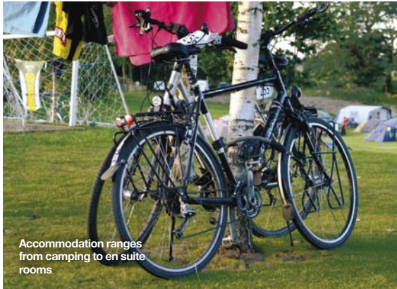
Accommodation ranges from camping to en suite rooms