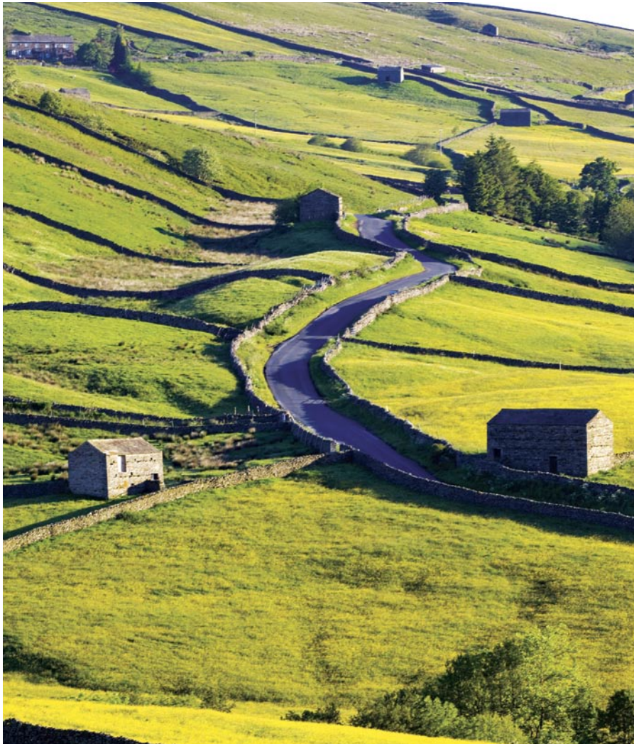
● (Left) Sprinter Marcel Kittel has said that Yorkshire's narrow roads and dry stone walls could be 'dangerous' for the peloton