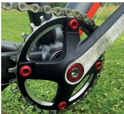
Above: Junior-friendly 152mm length and 135mm Q-factor cranks use thick/thin chainring teeth

The frame and contact points of the Creig Pro use Islabikes' carefully evolved proportional fit dimensions, with 580mm bars, super thin but bulged-end grips, and slimline saddle. Avid DB5 brakes are picked for a small-hand-friendly sweep. The 152mm Islabikes crank arms give an extra-narrow 135mm Q-factor (pedal stance) so shorter