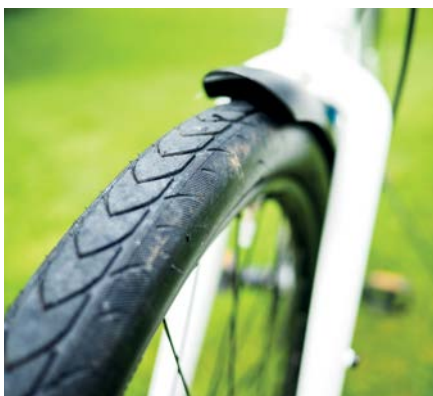
Above: Mudguard room is fine despite the tyre volume, as 650Bx47 is about the same diameter as 700x28

Frame and fork are aluminium. A diamond-shaped frame is available but Sarah chose the mixte version for easy mounting and dismantling, especially with a rear child seat fitted. The tall head-tube and swept back handlebars gave her the relaxed, semi-upright