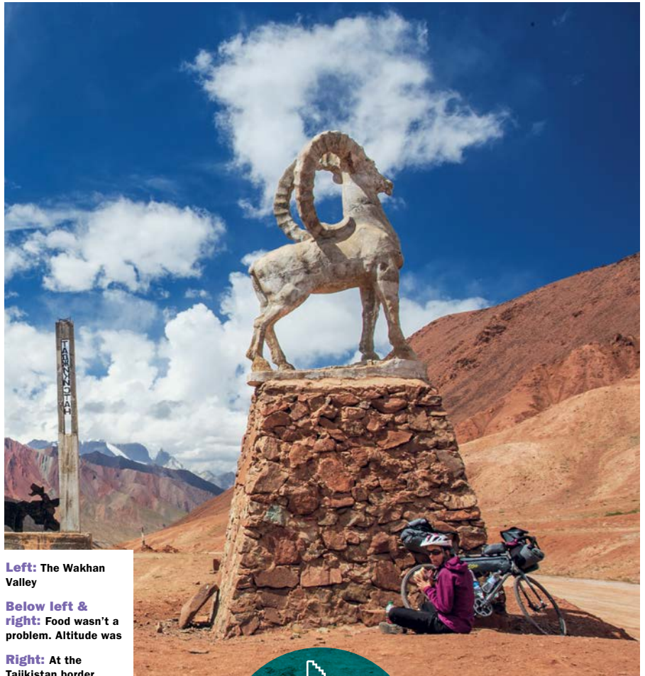
Left: The Wakhan Valley

The dirt road past the Tajikistan border twisted its tortuous way up into the Pamir Mountains. It met and exceeded our expectations: rough, tough and unbelievably beautiful. Not loose enough for a mountain bike but perfect for the ‘cross bikes to tackle.