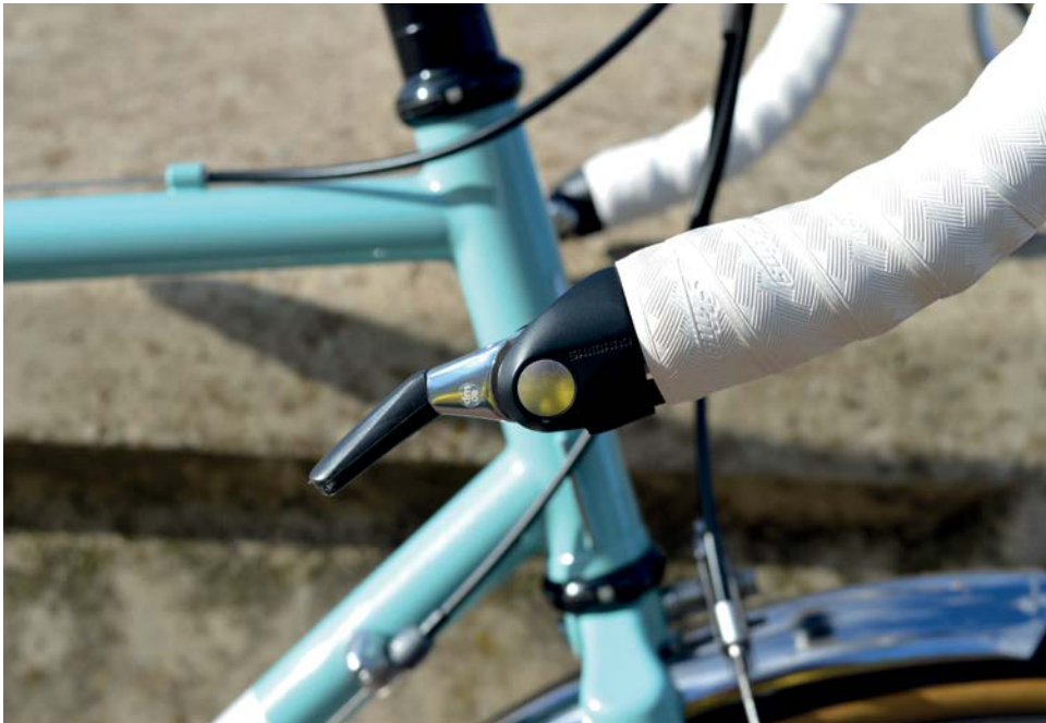
Clockwise from left: Dura-Ace bar-end shifters are simple and reliable. Comfortably quick tyres. Paint-wear prevention