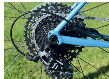
Above: With a 44t chainring and this huge 11-42 cassette, the Slate's gear range is 28-107in – a more useful range than many road bikes with compact doubles

A 650B WHEEL WITH A 42MM TYRE HAS ROUGHLY THE SAME DIAMETER AS A 700C WHEEL WITH A 23MM TYRE. SO GEOMETRY NEED NOT BE RADICALLY DIFFERENT