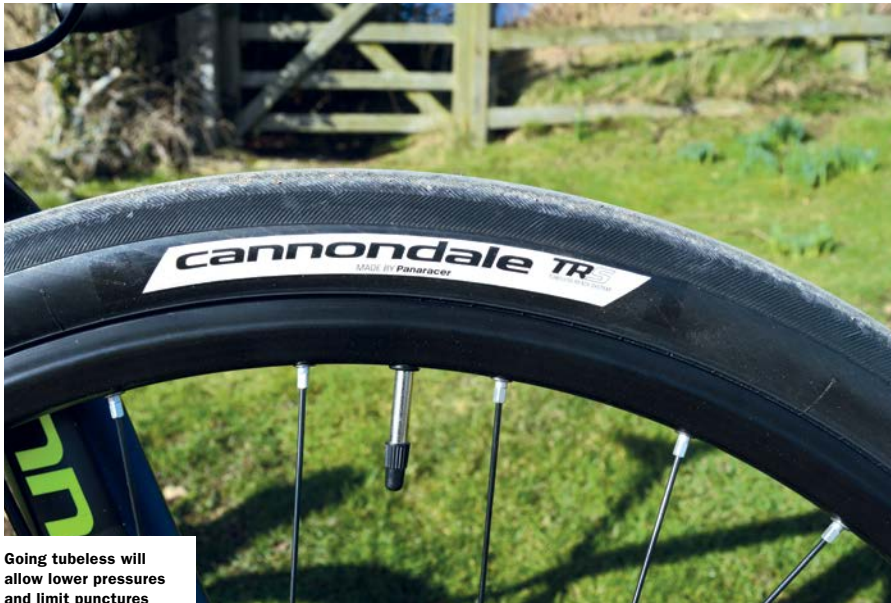
Going tubeless will allow lower pressures and limit punctures

happens when you sweep the lever even further . I'm sure I'd get used to it eventually. By contrast, the Dura Ace bar-end shifters of the 650 Adventure are idiot-proof. For recreational riding, I didn't miss the ability to shift from the brake hoods.