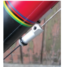
Clockwise from far left: 15 minutes undoing Allen bolts... The top tube lug clamps seat tube and post simultaneously. Cable splitter. Down tube clamp