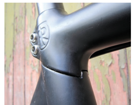
Above: While the seat tube extends into the top tube lug, the backbone of the joint is the seatpost

Ritchey supplies Break-Away framesets only, complete with travel case (80×70×33cm). The Carbon frame is a development of the design pioneered on the