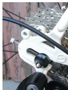
Clockwise from left: The separated joints need to be kept clean. There's no loss of strength or stiffness at the joint. Dropouts allow singlespeed or hub gear use

➤ coupling nuts are loosened using the special C-spanner supplied with the frame, and then unscrewed to allow the ends to be parted. Disassembled, it would fit in the Ritchey's case – or even a slightly smaller 26x26x10in (66x66x25.4cm) S&S case like this one: bit.ly/cycle-sandscase .