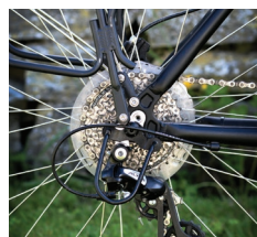
Above: The gear range is decent but could usefully be lower for loaded touring in hillier areas

You're invited to configure your own bicycle online, starting from a selection of seven styles (City, Dutch, Touring, Expedition, etc). Next, you fine-tune details from size through to the various accessories. It's fairly easy if you're familiar with the relative merits of different components, and especially good if you want or need a step-through frame and prefer a road (dropped) handlebar – a combination that's rare