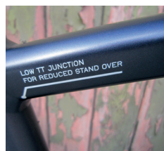
Top: Superimposed onto its natural environment (eye-roll) Above: Flat battery? Feeling fit? You can ride without help

But that down tube is hard to ignore. It's massive because it houses the e-bike's Fazua Evation power pack. This comprises a 250Wh battery and the drive motor, which are contained in one removable cartridge. The drive pack must be removed to turn the battery on (and off) and to recharge it, so the pack's lock and switch get