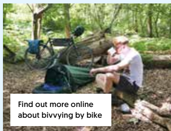
Find out more online about bivvying by bike

Cycling UK has built up a library of bikepacking-related content online, much of it appearing first in Cycle. It includes group tests, great rides, guides, and tips. Find out how to set up a tarp using your bike, which lightweight stove is best for camping, or learn more about our latest trail, King Alfred's Way, all at cyclinguk.org/bikepacking .