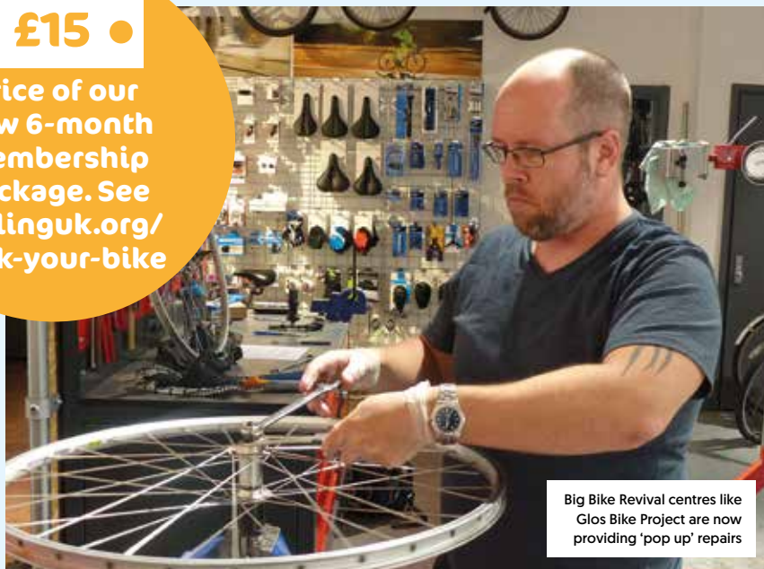
Big Bike Revival centres like Glos Bike Project are now providing 'pop up' repairs

Price of our new 6-month membership package. See cyclinguk.org/back-your-bike