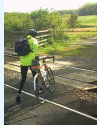
Crossing diagonally? Walking may be best

Since 2017, there have been more than 160 near misses with cyclists at level crossings across Britain's railway network. That's 160 too many: there are clear signs in place across each of the 6,000 crossings to keep everyone safe. Cycling UK has teamed up with Network Rail to create a guide of how to keep safe at level crossings. Most of it is common sense, like "no selfies". (It does happen!) Find out more at: cyclinguk.org/level-crossings .