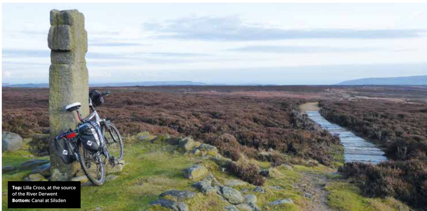
Top: Lilla Cross, at the source of the River Derwent Bottom: Canal at Silsden

recently-resurfaced Swale Trail, between Keld and Reeth, is an easy MTB/gravel/tourer ride through dramatic, almost fjordlike dalescapes. Reeth's sprawling green is picnic-perfect, and from here it's an easy run to Richmond, with its fine (but car-choked) square, riverside ruined castle, and ruined Easby Abbey. Then it's quiet, flat agricultural stuff, requiring map ingenuity to link bridleways official and unofficial. But that first half is something special.