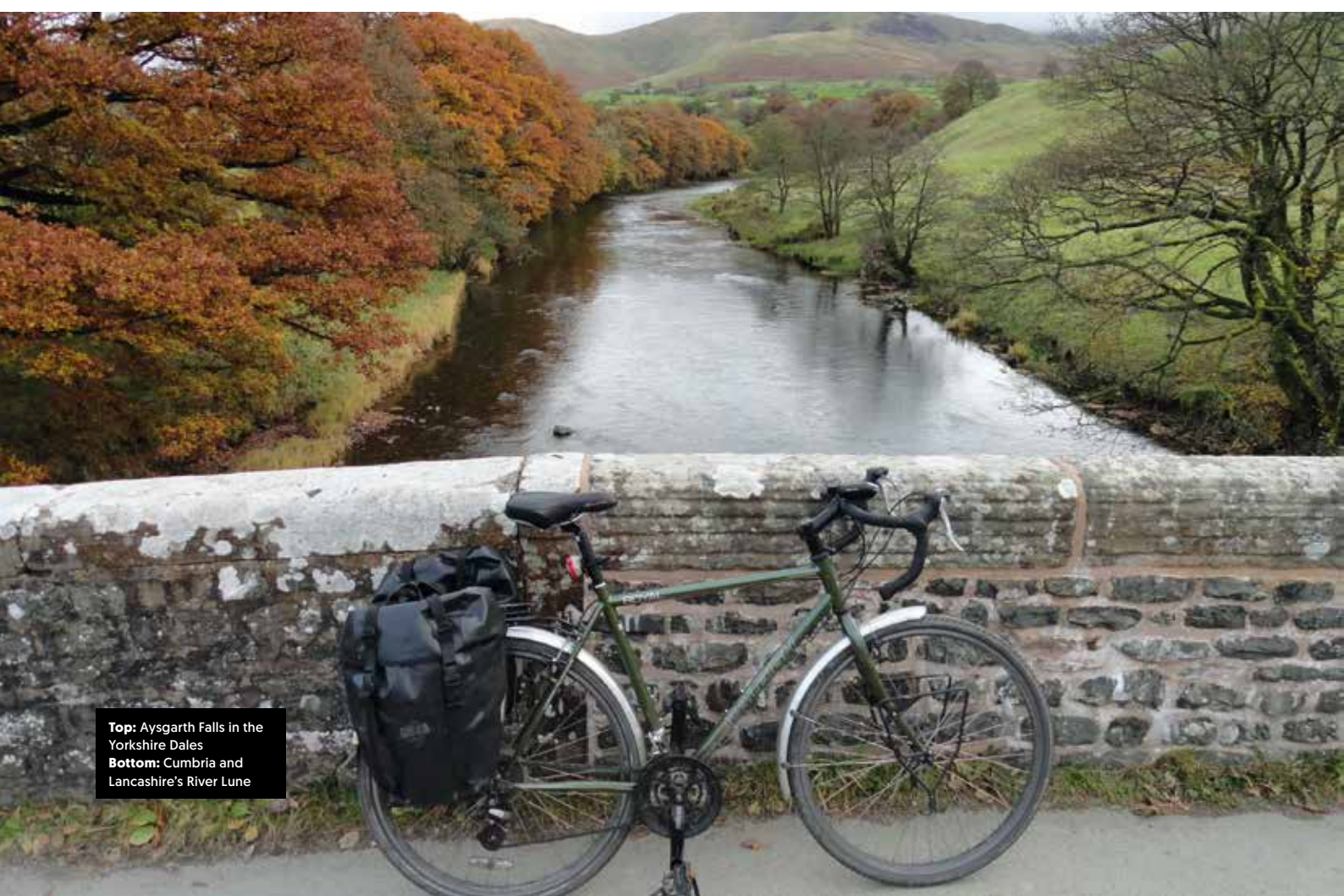
Top: Aysgarth Falls in the Yorkshire Dales Bottom: Cumbria and Lancashire's River Lune