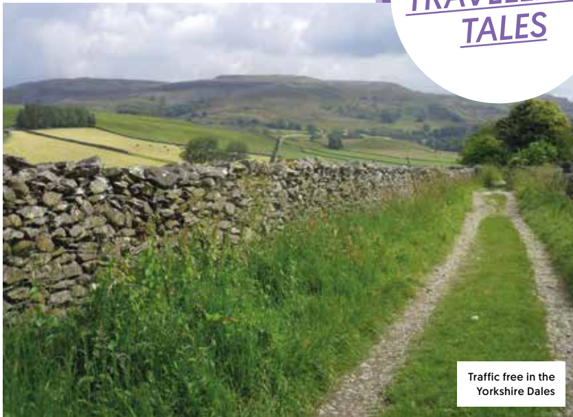
Traffic free in the Yorkshire Dales