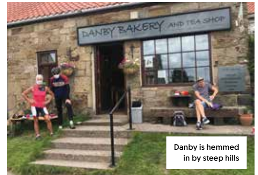
Danby is hemmed in by steep hills