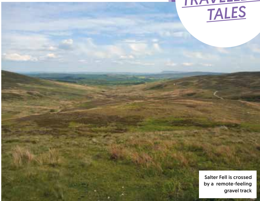
Salter Fell is crossed by a remote-feeling gravel track