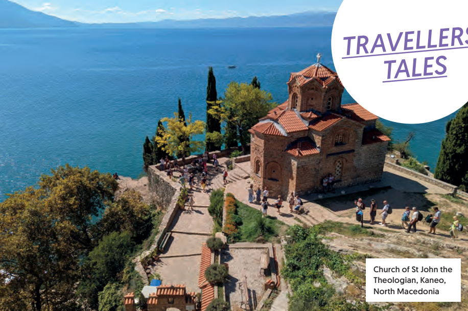
Church of St John the Theologian, Kaneo, North Macedonia